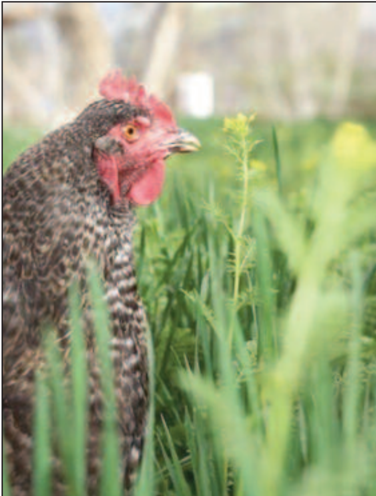
El Pinto is the only animal welfare approved restaurant in the nation.

This event was corporately sponsored by Mooring Restoration and Construction who graciously provided goodie bags for all. Following a hot and spirited competition for Mooring’s $50 Amazon rewards card for the Best Cowboy Boots, El Pinto kicked in the swag, too, by sending everyone off with a coupon for a free jar of their award-winning salsa.